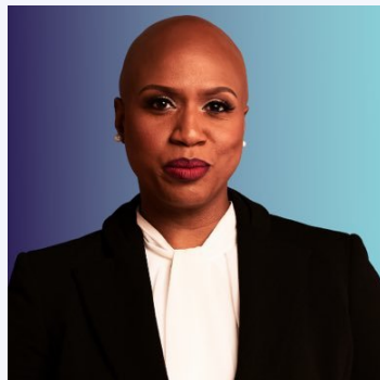
Ayanna Pressley Congresswoman