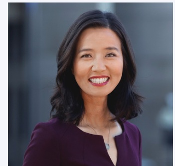
Michelle Wu Mayor of Boston