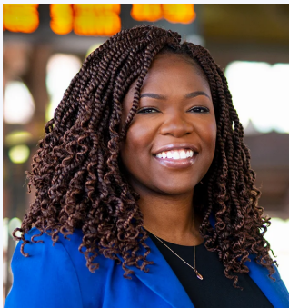
Ruthzee Louijeune Boston City Councilor at Large