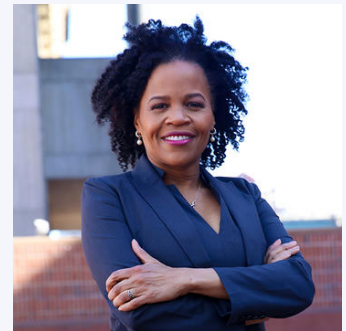
Kim Janey Former Mayor of Boston